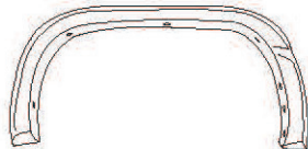
Left Front Flare