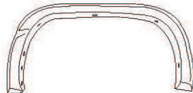
Right Front Flare