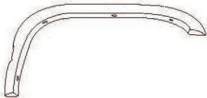
Right Front Flare