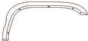
Right Front Flare