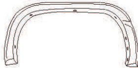
Left Front Flare