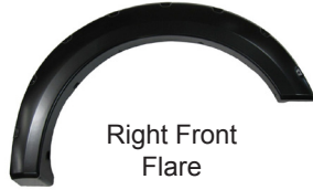
Right Front Flare