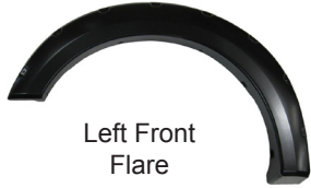
Left Front Flare