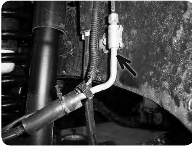
Figure 6B - After