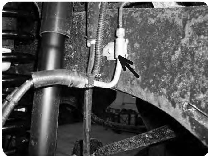
Figure 6A - Before