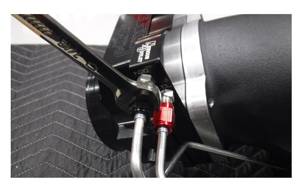
Step 16: Using a 7/16" wrench, tighten the compression and b-nuts on each hardline.

Step 14: Repeat the same steps to install the nitrous hardline.