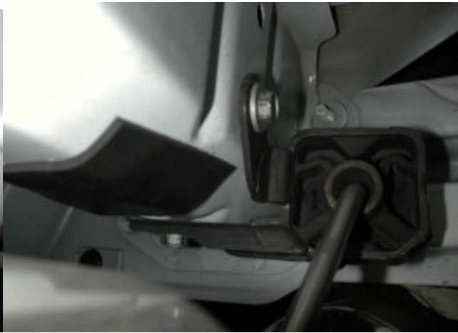
D-Side Rear Bracket