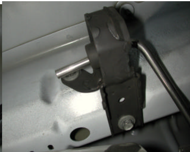
P-Side Front Bracket