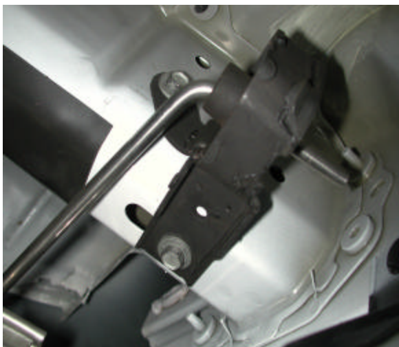
P-Side Rear Bracket