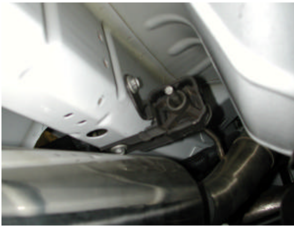
D-Side Front Bracket