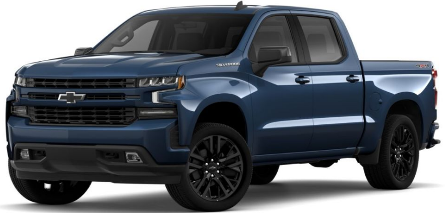
2019 Silverado / Sierra (CT19CB)

Thanks for purchasing a Stainless Works catback exhaust system for your 2019 Chevy Silverado / GMC Sierra. Our team has worked to ensure that this product is the premium in performance, quality, and fitment. We are proud to say that this system will unleash the true character of your vehicle. We encourage you to read through the following steps, and check the included Bill of Materials before beginning. Please follow these steps to ensure that your installation goes as planned.