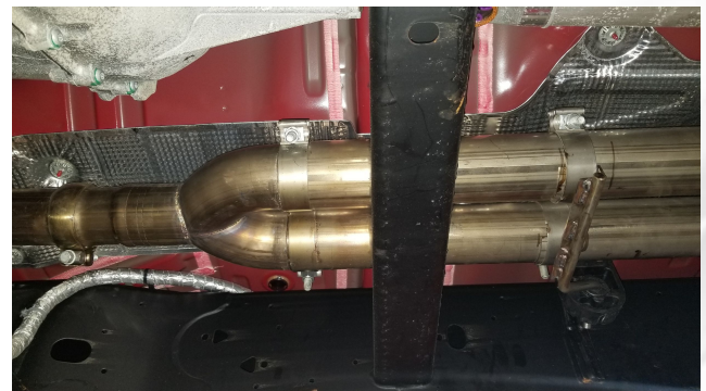
Detail 9: Y-pipe connection and inlet pipe hanger installed.