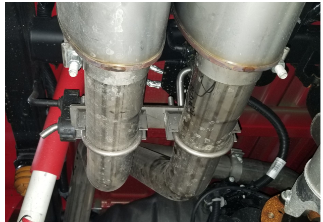
Detail 12: Hanger assembly behind mufflers

After double checking for clearance and making sure all lines, wires and hoses are secured, drive the truck for 10-20 miles and re-check all clamps and clearances. Your system may be tack welded at the joints/ clamps to reduce shifting of the system during heating and cooling cycles. Make certain to disconnect the battery before performing any welding.