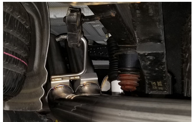
Detail 13: Rear tail hanger assembly, viewed from rear of vehicle.