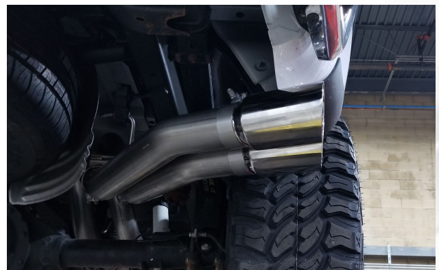
Detail 14: System installed. View from rear of vehicle.