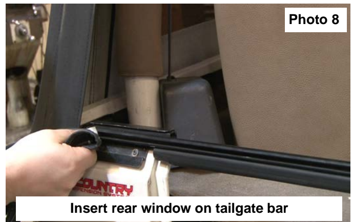
Insert rear window on tailgate bar