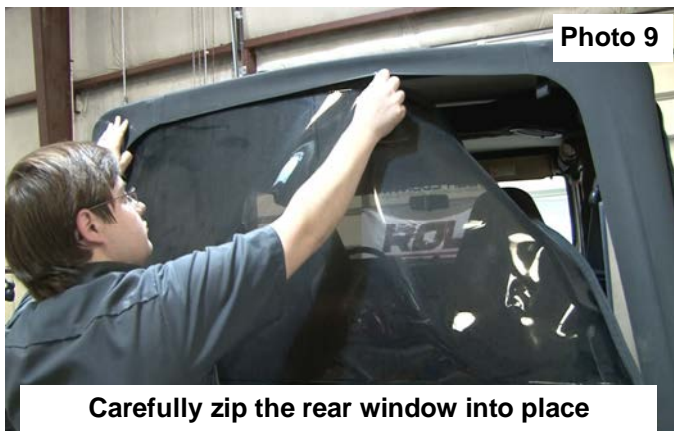
Carefully zip the rear window into place