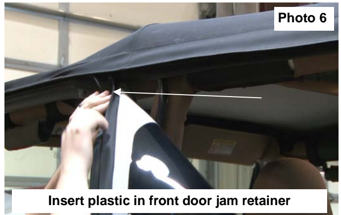
Insert plastic in front door jam retainer