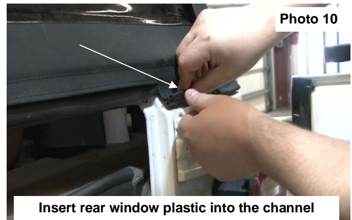
Insert rear window plastic into the channel