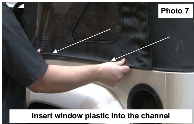
Insert window plastic into the channel