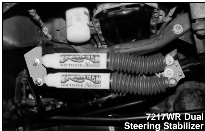
7217WR Dual Steering Stabilizer

The SOFTRIDE® rear springs used in the Systems are also available separately.