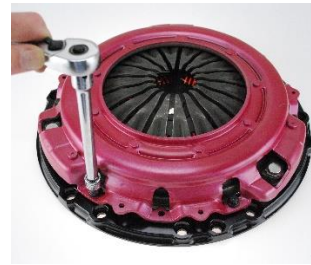
Removing 6 – cover bolts