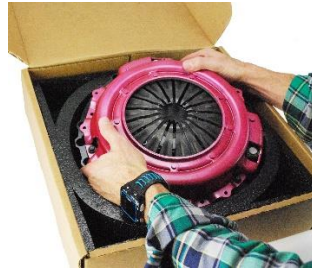
removing assembly from box