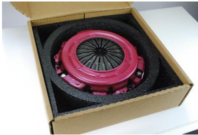
Concept 10.5 unit in box

Remove the clutch system from the box. Remove the 6 – M8 bolts that retain the pressure plate to the base ring and lift the pressure plate and top disc. DO NOT unbolt the 3 bolts that retain the floater plate to the base ring