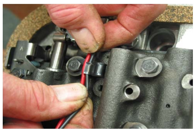
Figure 5 Figure 6

6. Carefully fasten the wires using the original metal clips on the valve body bolts. See Figures 6 and 7. Attach the red connector to the new 4<sup>th</sup> gear pressure switch. See Figure 8.