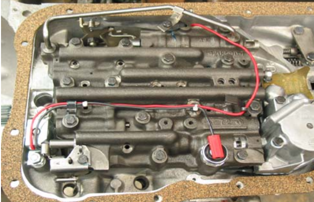
Figure 9 Figure 10