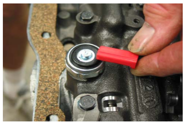
Figure 7 Figure 8