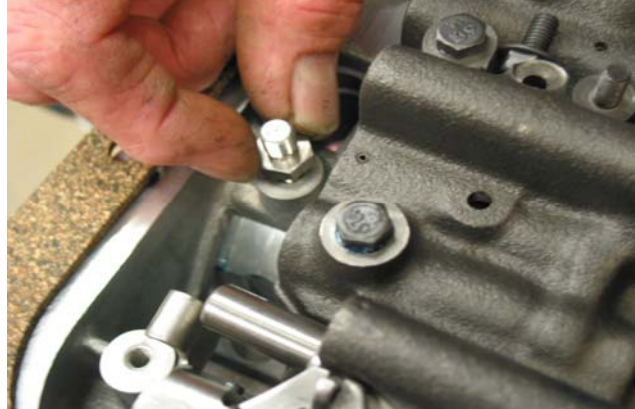
Figure 3 Figure 4