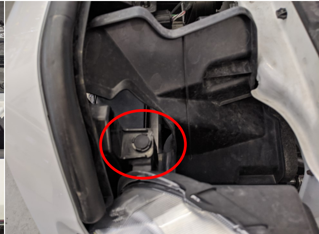
Figure 1b: Grille clip locations

2. If you have a Dynamic Radar Cruise Control (DRCC) you will have a radar sensor behind the Toyota emblem. You will need to remove the wiring harness and unplug the sensor before removing the grille. Figure 2.