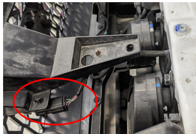
Figure 2: Harness locations

2. If you have a Dynamic Radar Cruise Control (DRCC) you will have a radar sensor behind the Toyota emblem. You will need to remove the wiring harness and unplug the sensor before removing the grille. Figure 2.