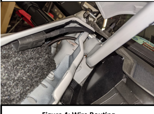
Figure 4: Wire Routing