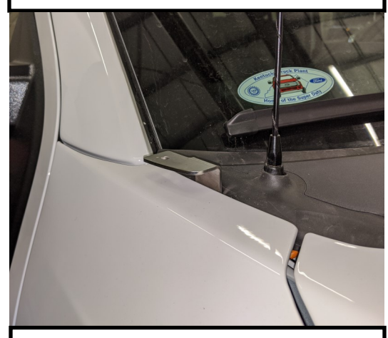
Figure 3: Bracket Orientation