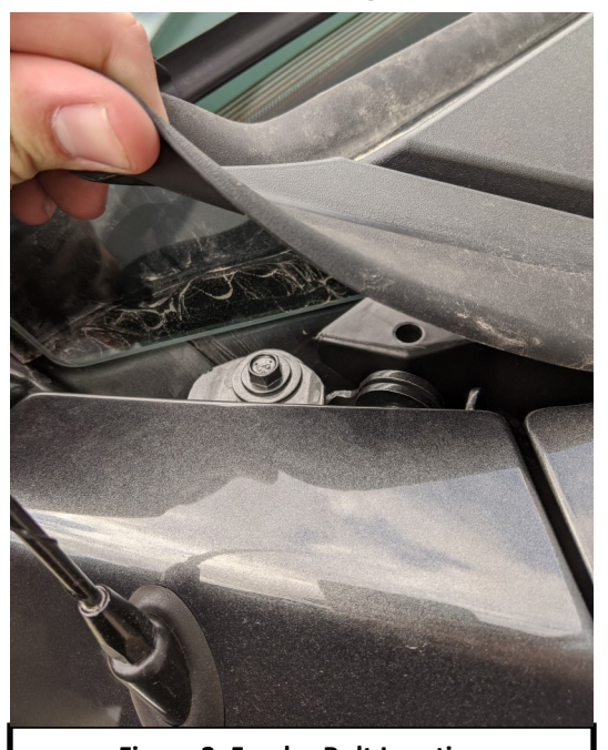
Figure 2: Fender Bolt Location