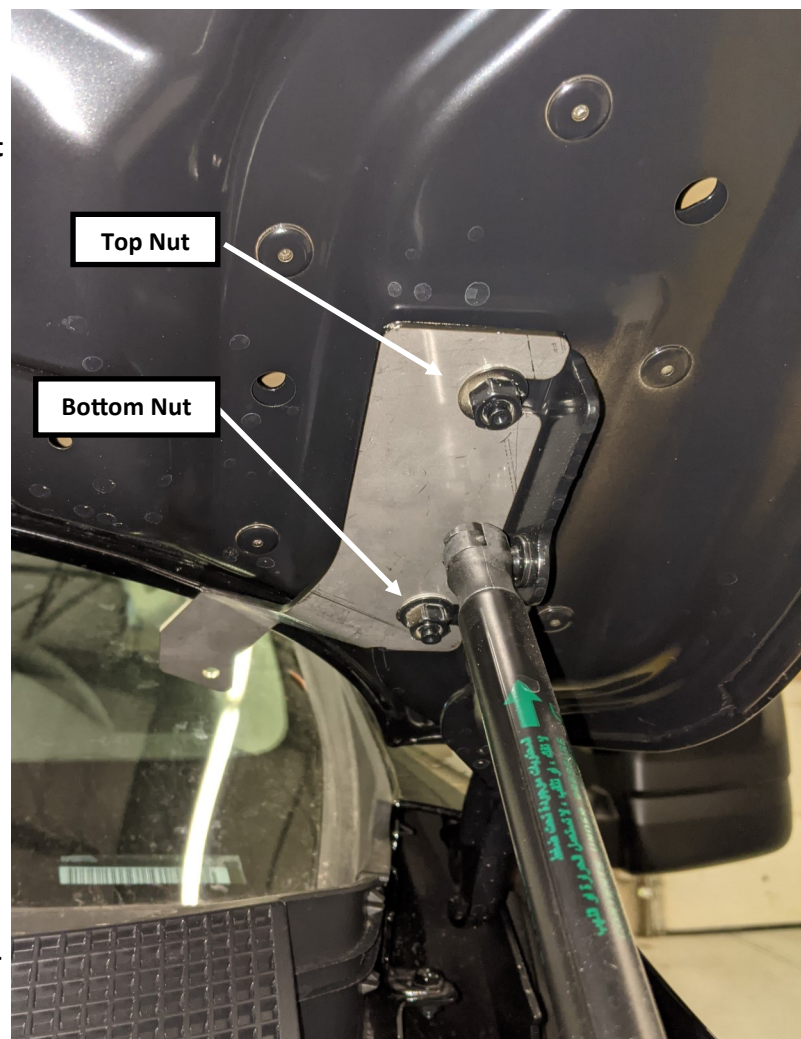
Figure 2: Bracket Installation.