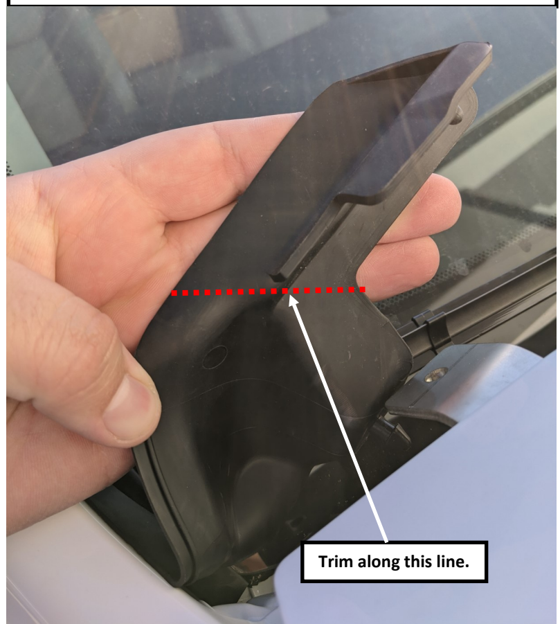
Figure 3: Gasket Trimming.