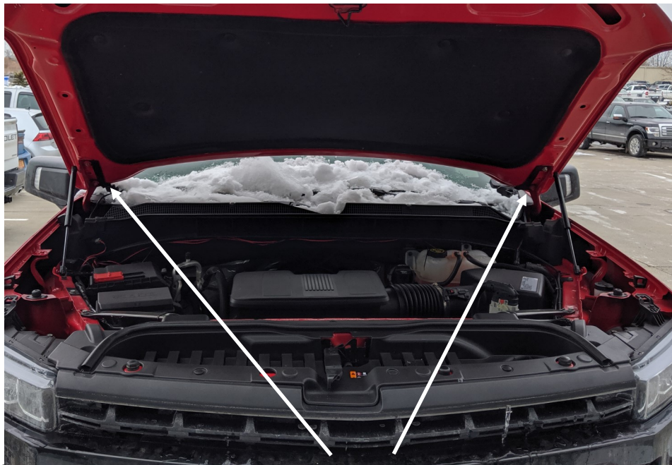
Figure 1: Bracket Locations

The brackets are designed to utilize the factory mounting locations for the hood hinge. These locations are shown in Figure 1 .