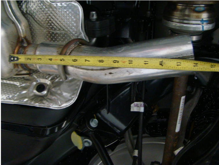
Fig. No. 1: Driver Side.