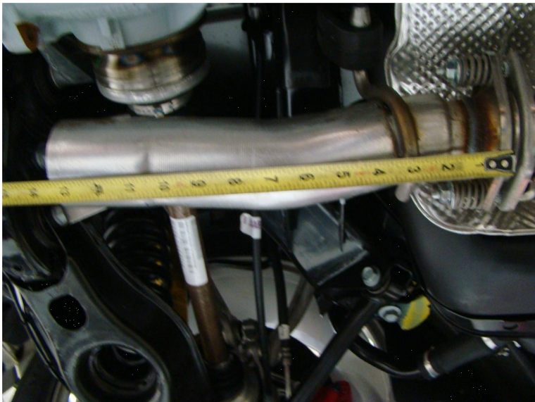
Fig. No. 2: Passenger Side.

** Magnaflow Performance Exhaust recommends professional installation on all their products