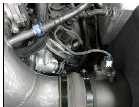
28. Connect the CCV to the fitting on the K&N driver side intake tube. Reconnect the MAF electrical connection.