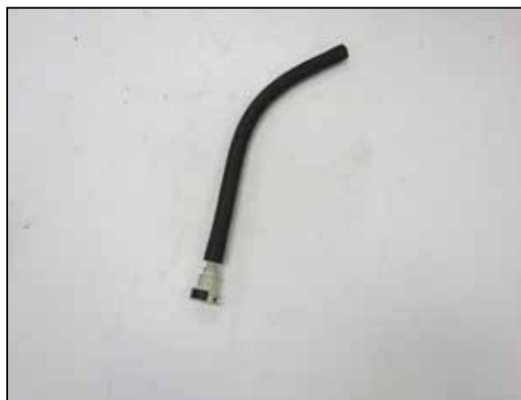
24. Remove the quick connect fitting from the factory EVAP hose and install it into the provided longer EVAP hose.