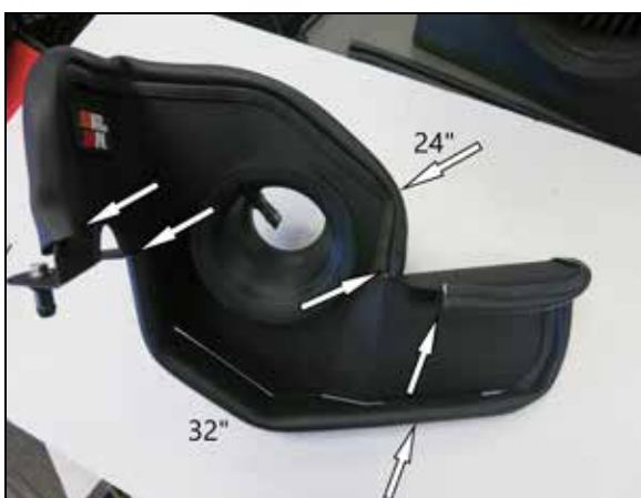
19. Install the edge trim onto the passenger side heat shield as shown. Install the K&N badge into the passenger side heat shield and secure with the provided locking tab.