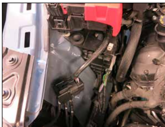
21. Lay the relay loosened in step #8 onto the inner fender as shown.