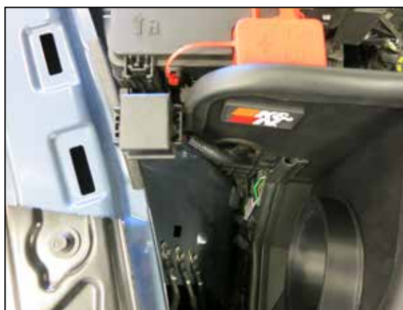
22. Install the K&N passenger side heat shield into the vehicle so the mounting stud inserts the factory mounting grommet and secure with the factory air filter housing mounting bolt. Reinstall the relay onto the factory mount making sure the wiring harness is not pinched between the heat shield and body.