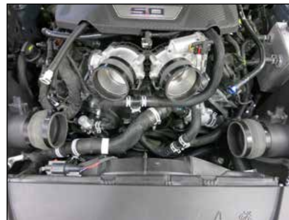
26. Install the straight couplers onto the throttle bodies and secure with the provided clamps. Install the step couplers onto the K&N MAF housings and secure with the provided clamps.