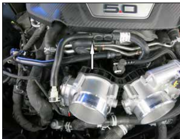
23. Disconnect the EVAP hose from the check valve fitting where shown.