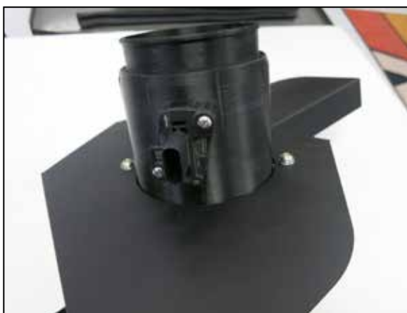
17. Remove the mass air sensor from the factory passenger side housing and then install it into the K&N passenger side housing using the provided hardware.