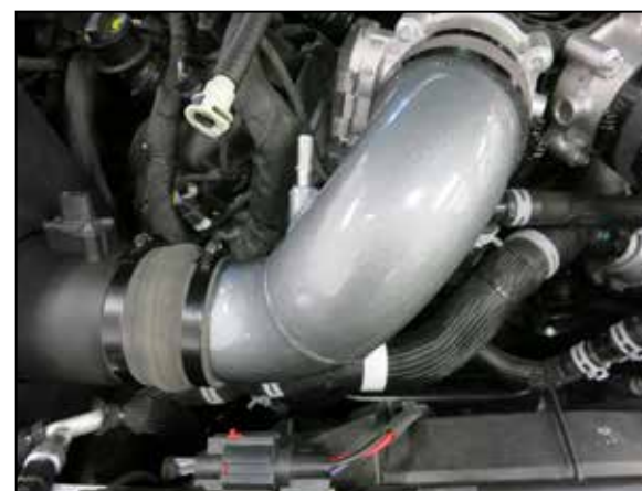
29. Install the K&N passenger side intake tube into the couplers, adjust for best fit and then secure with the provided hose clamps.