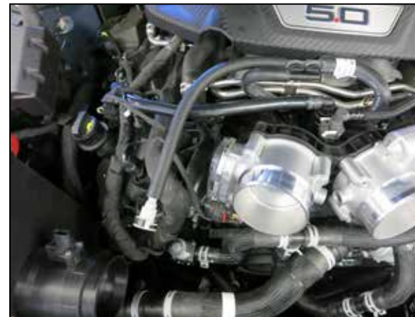
25. Install the longer EVAP hose assembly onto the check valve fitting.