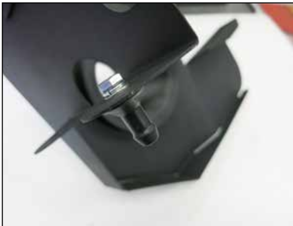
16. Install the remaining mounting stud to the passenger side heat shield using the provided hardware.