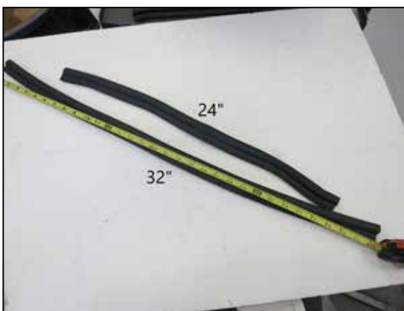
18. Cut the provided 56" edge trim into lengths of 32" and 24" as shown.