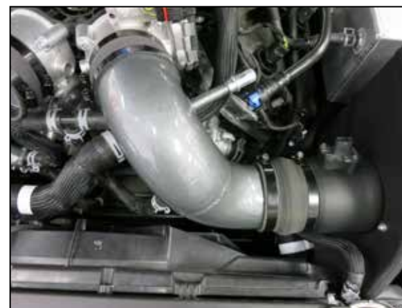
27. Install the K&N driver side intake tube into the couplers, adjust for best fit and then secure with the provided hose clamps.