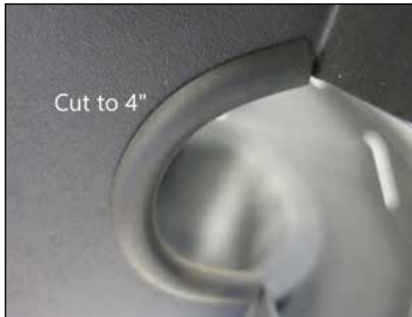
20. Apply a few drops of the provided super glue the inside of 1/16" edge and then install the edge trim as shown to the passenger side heat shield.