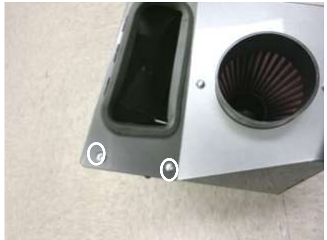
j. Install the remaining [2] bolts shown above.