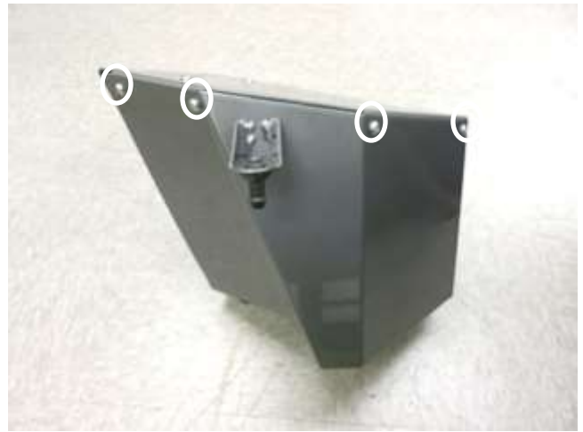
h. Install [4] bolts show above.