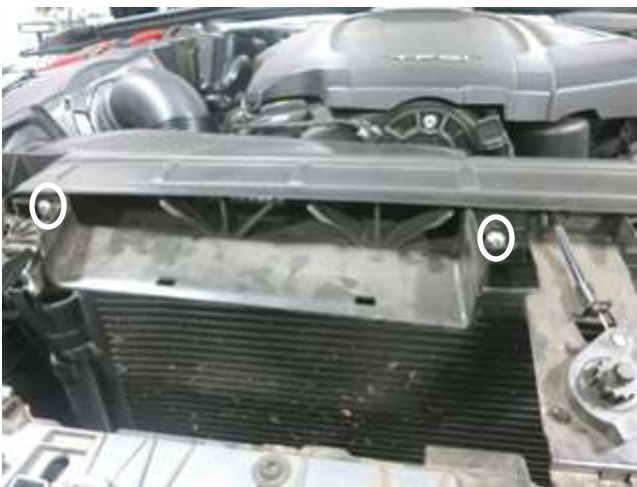
c. Remove the [2] T25 Torx screws shown above and remove the air inlet scoop.