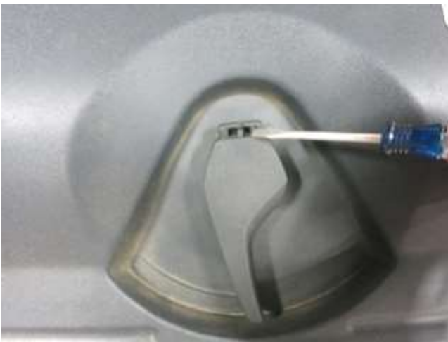
a. Use a small flat head screwdriver to pull out the retaining clip and remove the hood release lever.