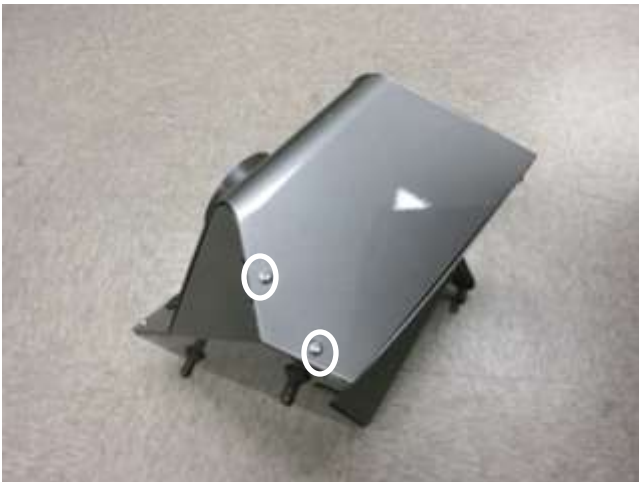
i. Install [2] bolts shown above.