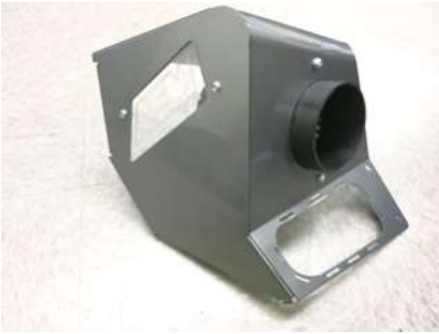
e. Install the AEM filter with velocity stack onto the air box. Refer to the exploded view for the appropriate hardware.