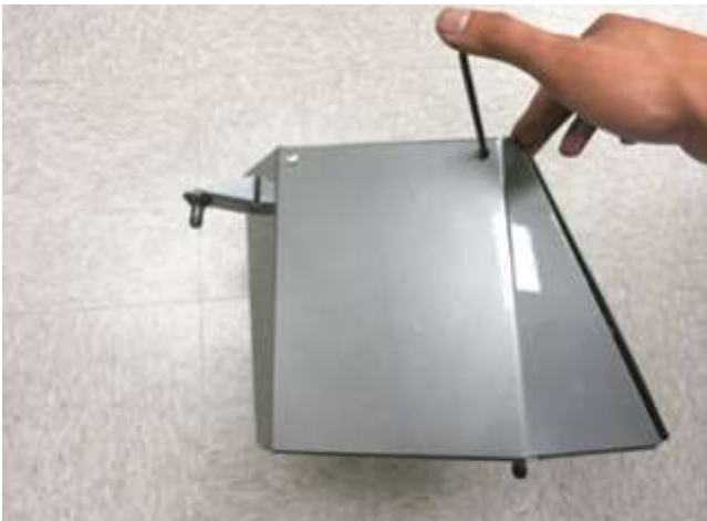
g. Install the two halves of the air box together. Due to variances in the manufacturing process, slight misalignments between the holes and threaded nut-serts may be present. You can align one hole with a small screwdriver while tightening the adjacent hole.