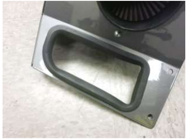
f. Install the rubber gasket removed in step 2g.