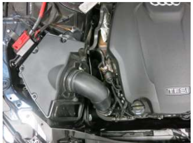
d. Loosen the hose clamp on the intake pipe at the turbo inlet.