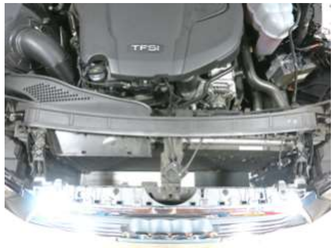
b. Carefully pull the radiator shroud out.