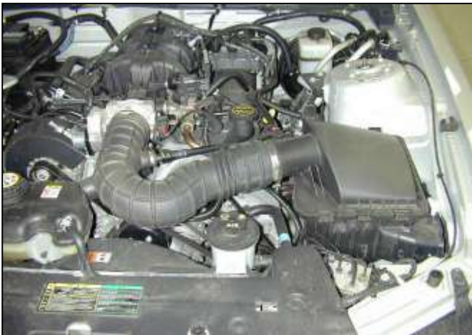
Factory airbox system installed

r. Plug in the wire harness into the MAF sensor.