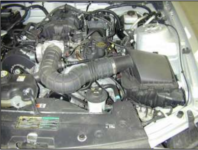
a. Factory airbox system.