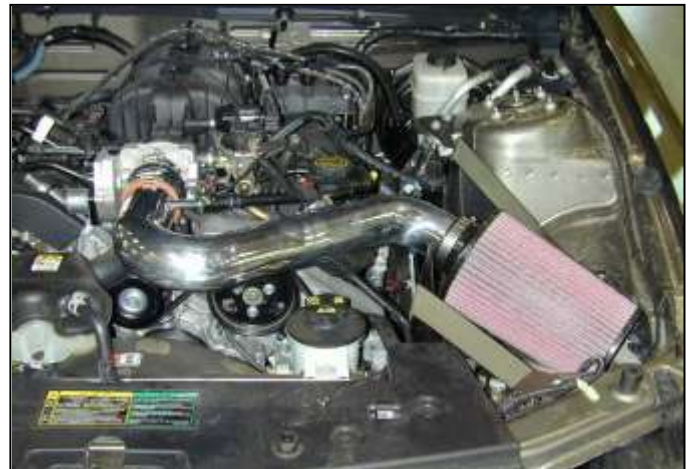
AEM® intake system installed