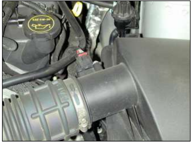
b. Unplug the wire harness from the Mass Air Flow (MAF) sensor.