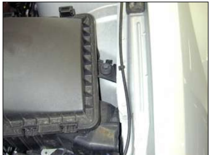
d. Remove the bolt securing the stock airbox to the vehicle. Lift up on the stock airbox until it is free from the vehicle.