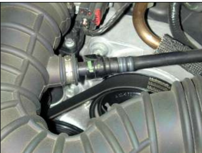
c. Loosen the hose clamp on the throttle body attached to the stock intake hose. Unplug the plastic breather hose connected to the intake hose. This is done by sliding the green retaining clip until the hose is free from the nipple.