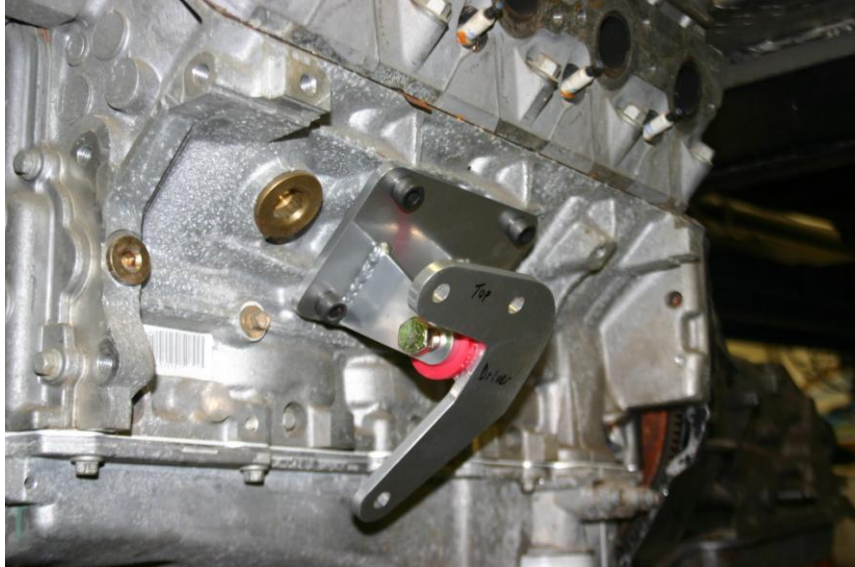
(Detailed view of driver's side motor mount and frame bracket on engine)

Step 1: Locate the Driver's Side (LEFT) and Passenger's Side (RIGHT) motor mounts and loosely bolt them to the engine using the supplied 10mm allen head bolts, now loosely bolt the frame brackets to the engine mounts using the supplied ½"-13 x 4" long bolts and nylon lock nuts. (The bolts will be tightened after the engine is set in place and everything is lined-up)