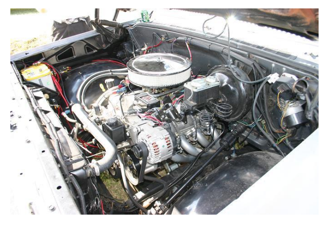
(Carbureted LSx engine in 73-87 GMC truck)