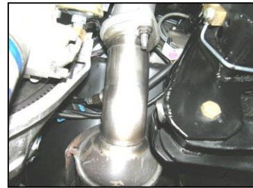
Examples shown – not actual parts