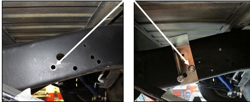
Figure 3 Passenger's side tailpipe hanger attachment – use factory hole at arrow point