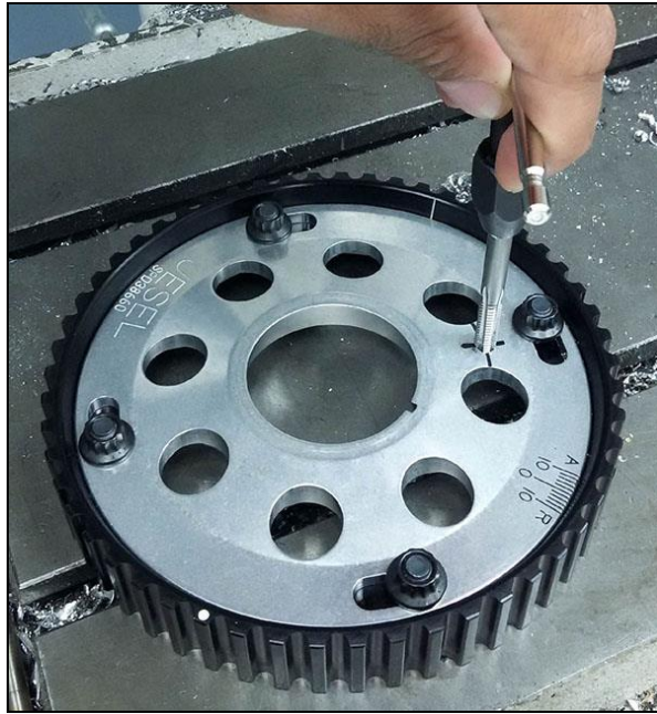
Step 6: Tap hole.

NOTE: If the flying magnet screw happens to break through and protrudes beyond the rear face of the cam drive's spider gear, ensure that it does not make contact with the underlying cam cover studs. This can be done by ensuring that the engine can be rotated a full revolution (mind camshaft end-play) without interference. If contact is made, excess material should be cut or ground off the end of the screw. Care must be taken to prevent from putting too much heat into the part as doing so could weaken the encapsulated magnet or melt the surrounding epoxy.