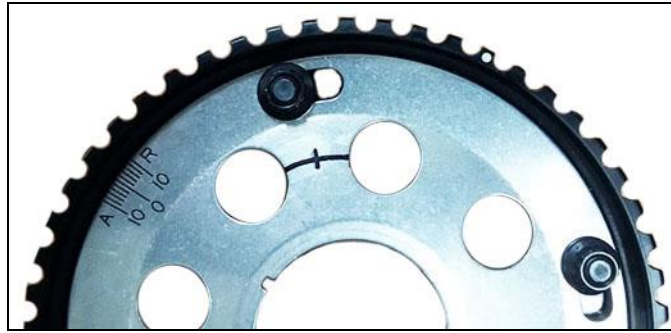
Step 3 & 4: Locate hole.