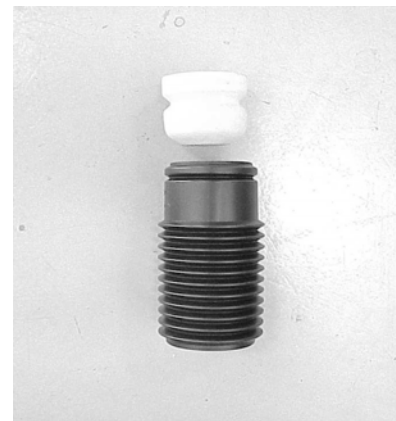
OE front bumpstop / Eibach boot