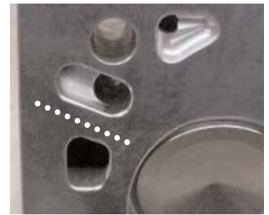
Figure 1 - Silicone Strip