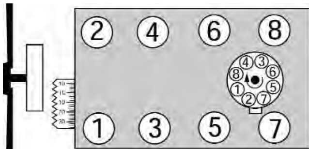
Figure 1 - 396-454 C.I.D. Chevrolet V8

IF YOU HAVE ANY QUESTIONS ABOUT THIS APPLICATION, PLEASE CONTACT OUR TECHNICAL DEPARTMENT IMMEDIATELY.