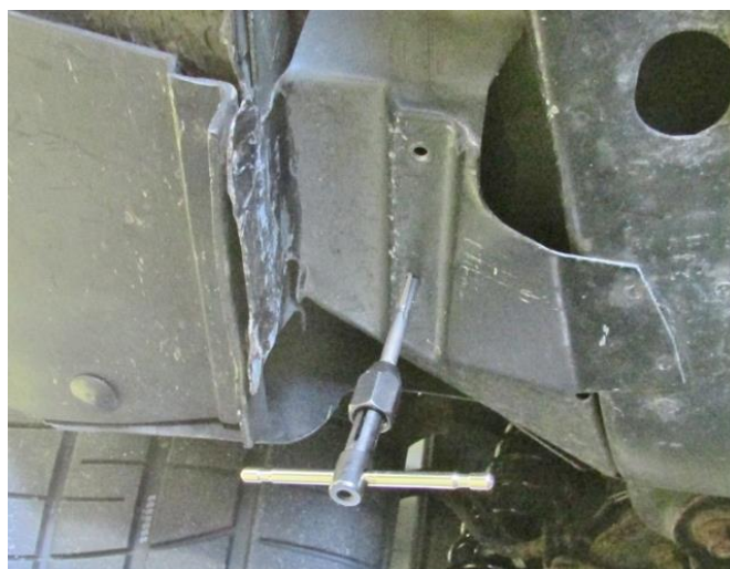
Figure 3 - Tap Framerail Holes