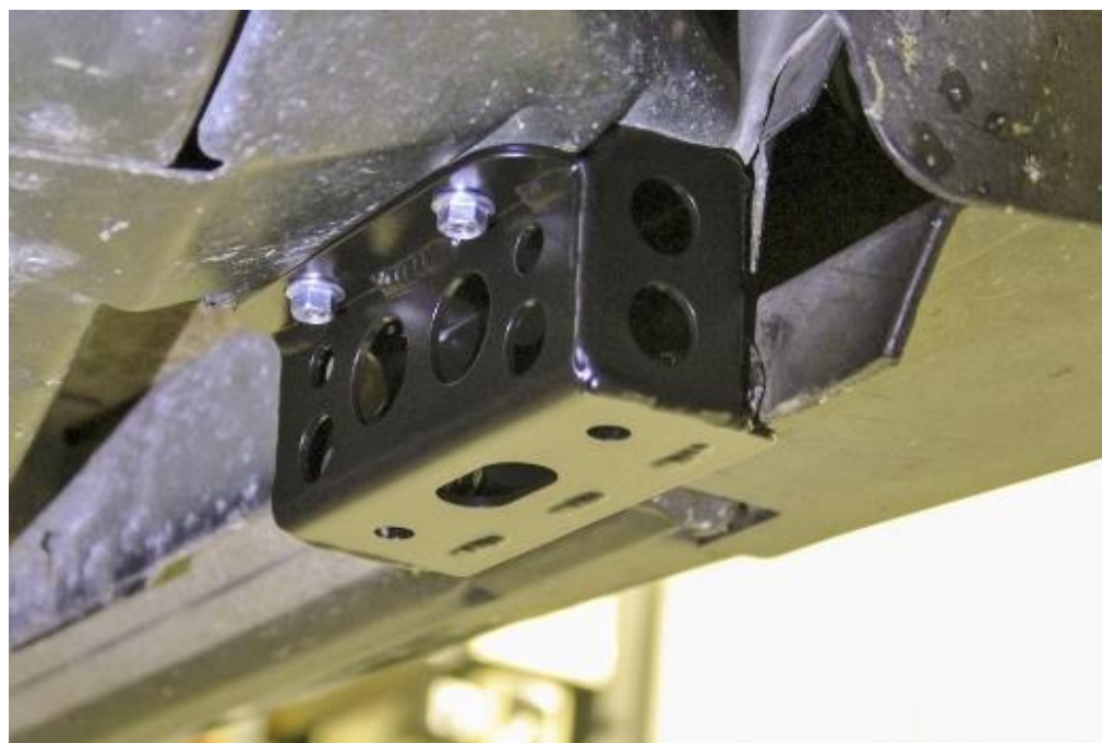
Figure 5 - Locate Fender Flange Shield