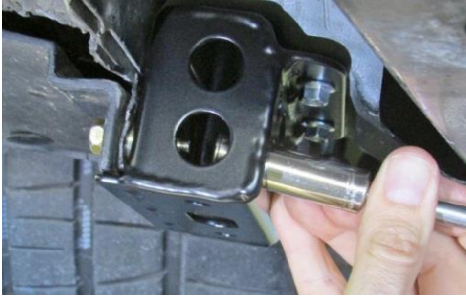
Figure 6 – Install Nylock Nuts