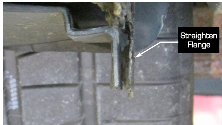
Figure 2 - Straighten Fender Flange