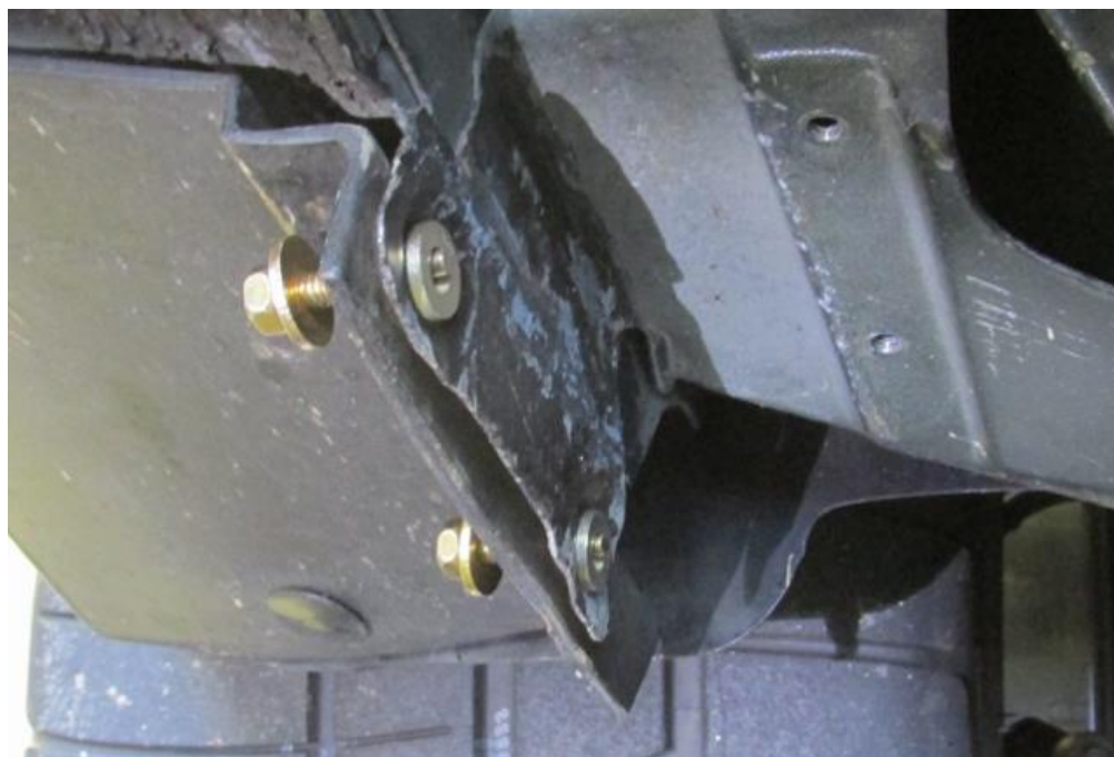
Figure 4 - Install Hardware