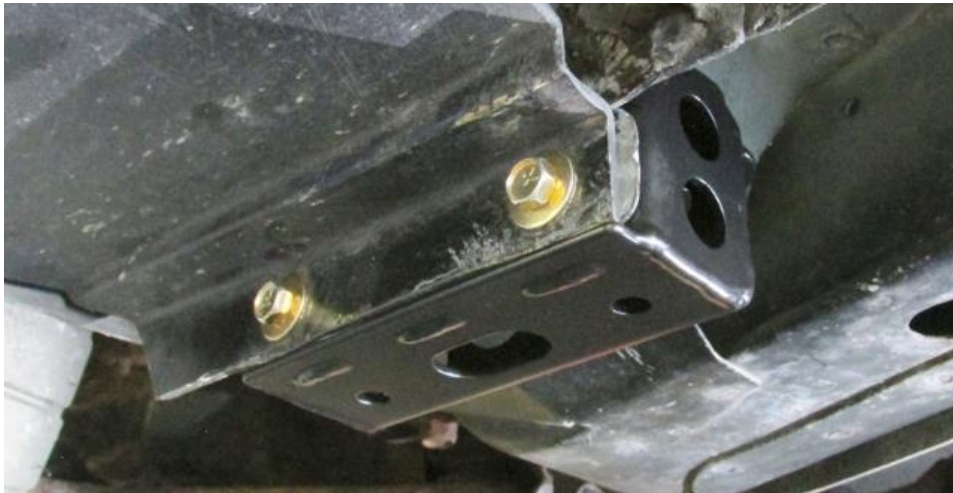
Figure 7 – Tighten Hardware

If you have any questions before or during the installation of this product please contact Detroit Speed Inc. at tech@detroitsspeed.com or 704.662.3272