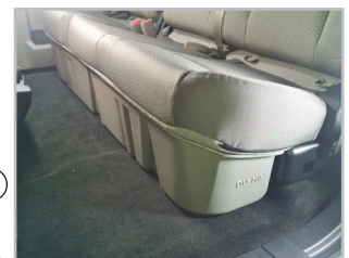
This is how the DU-HA should look installed under the back seat.

Pull the lever under each back seat to return the seat bottoms to the down position. Please note: When the seat is down, it does not latch. The seat is designed to latch only when it is up. (To test this, you may put the seat down without the DU-HA underneath. Note that it does not latch down.)