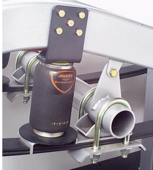
Typical underframe installation