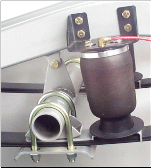
Typical sideframe installation