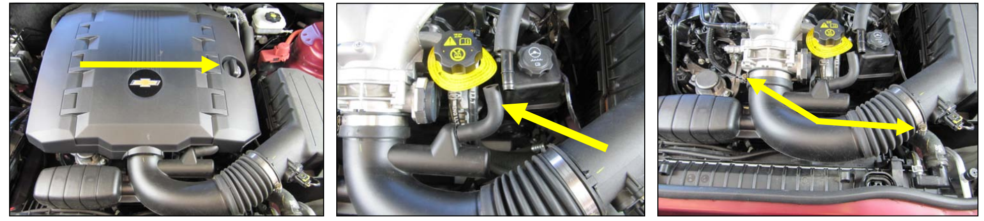
1. Disconnect the negative battery terminal. Remove the oil cap and lift up on the engine cover to unseat it from the mounting grommet. Replace the oil cap for now to prevent debris from entering the valve cover.

Full color instructions can be viewed on our web site at Airaid.com. If you need any assistance please call 1-800-858-3333 to speak with a representative in our Customer Service Center before returning the product.