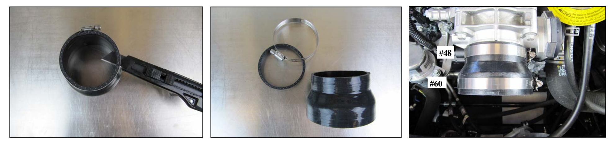
7. Using a utility knife or equivalent, trim the Coupler in one single pass.

6. <u>2010 and 2011 Models Only:</u> The Coupler will need to be re sized. Slide the # 48 clamp onto throttle body side of the coupler and flush with the edge. Tighten the Clamp but do not over tighten, causing collapse. This is to be used as the blade guide.