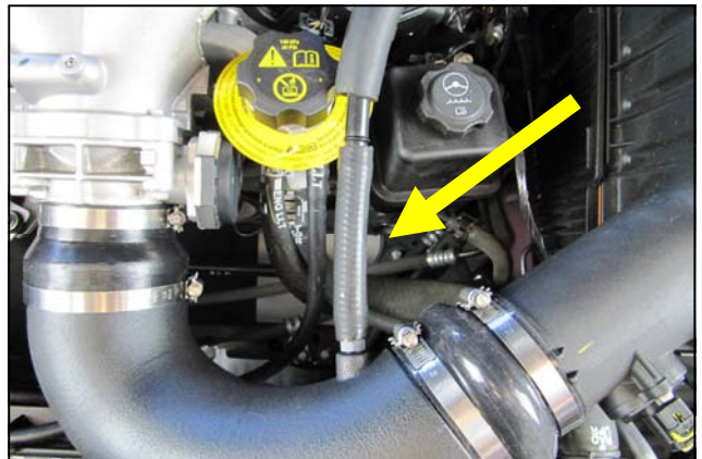
12. Connect the breather line from step 2. to the Airaid Intake Tube using the 1/2" hose.