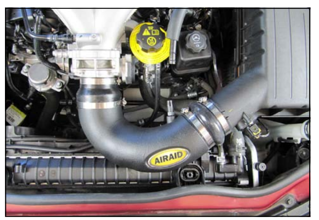
11. Insert the Intake Tube assembly into the Hump Hose first then into the Coupler on the throttle body. Align the components and tighten the Clamps.