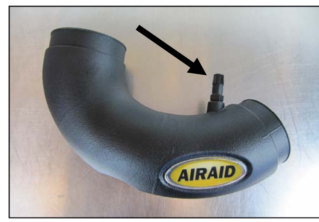
10. Install the Barbed Fitting into the Airaid Intake tube. Apply the Airaid Bubble Decal onto the Intake Tube as shown.