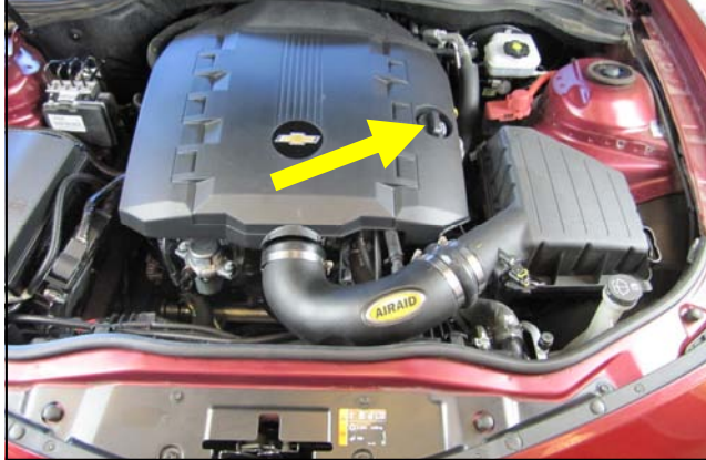
14. Reinstall the engine cover and oil cap. Reconnect the Battery.