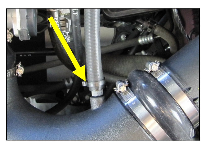
13. Secure the Breather Hose using the plastic Speed Clamp.