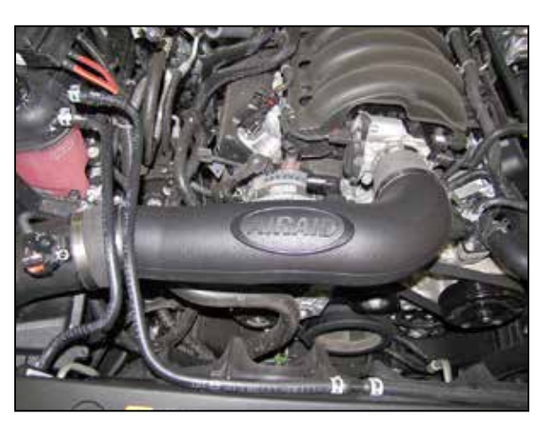
10. Install the AIRAID<sup>®</sup> intake tube into the coupler on the air filter housing and then onto the throttle body, adjust the tube for best fit and then secure with the provided hose clamps.