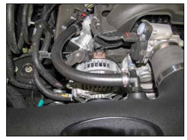
12. Connect the Crank case vent hose quick connect fitting onto the valve cover port and then connect the open end to the fitting installed into the intake tube and secure the hose clamps.