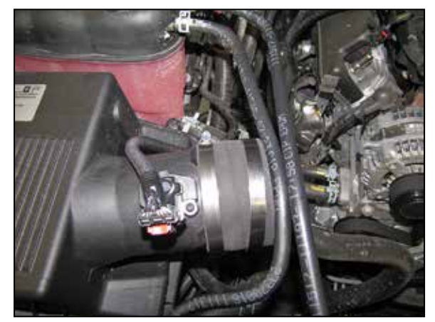
9. Install the provided coupler (08760) onto the factory air filter housing as shown.