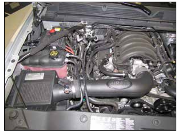
13. Double check your work!Make sure there is no foreign material in the intake path.Make sure all clamps, hoses, bolts, and screws are tight.Double check the hood clearance!Reconnect the negative battery cable!

Thank you for purchasing the Airaid Intake System. Contact Airaid @ (800) 498-6951 8:00 AM - 5:00 PM MST weekdays for questions regarding fit or instructions that are not clear to you. Your Airaid Intake System was carefully inspected and packaged. Check that no parts are missing, or were damaged during shipping. If any parts are missing, contact Airaid. The air filter element is protected from direct exposure to water and debris; care should be taken not to drive through deep water. WATER INGESTION IS THE DRIVERS RESPONSIBILITY! The air filter is reusable and should be cleaned periodically.