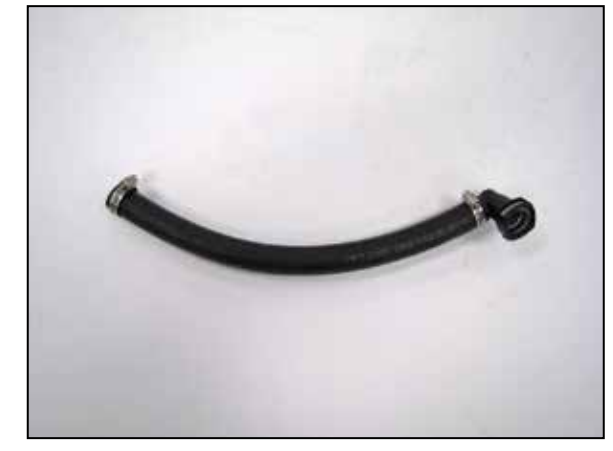
11.Install the provided 90° quick connect fitting and hose clamps onto the provided crank case vent hose as shown.