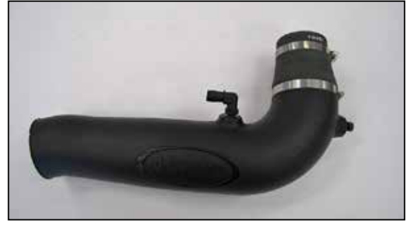
8. Install the provided step coupler (084104) onto the AIRAID<sup>®</sup> intake tube as shown.

NOTE: Plastic NPT fittings are easy to cross thread. Install the vent fitting "hand" tight, then turn it two complete turns with a wrench.