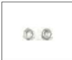
1/4-20 Nut (2)