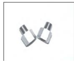
S. Steel Adapter (2)