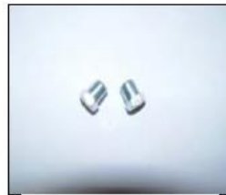
1/8 NPT plug (2)