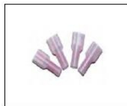
Female Terminal (4)