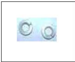
1/4" Lock Washer (2)