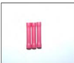
Butt Connectors (3)