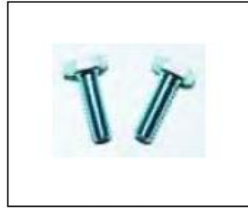
1/4-20 Nut (2)