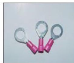
5/16" Connectors (3)