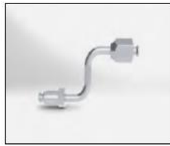
S. Steel Brake Line To Front Brake Line