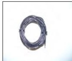
18 ga. Wire