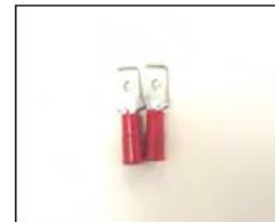
Male Terminals (2)