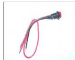
Lit Momentary Switch