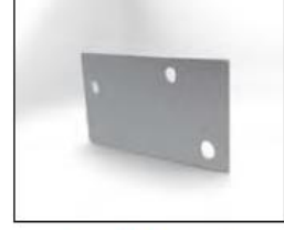
S. Steel Bracket